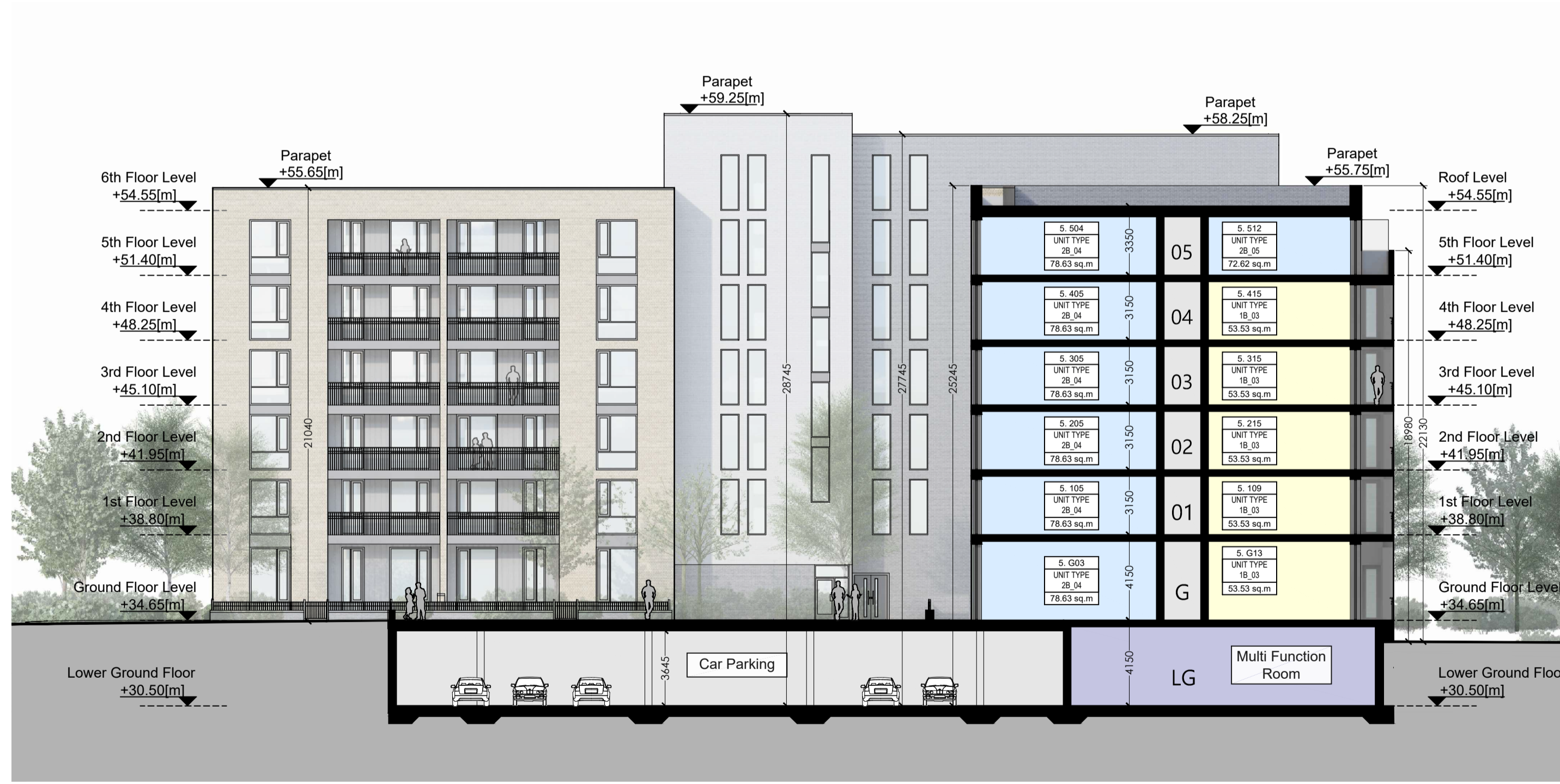
Elevation / Section D-D - Block 5 Scale 1:200 @A1